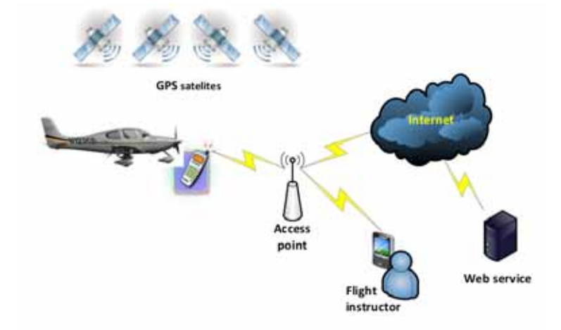
Fig. 3. The Concept of Mobile Navigation on Android

The tracking function serves light-airplane's instructors as a means of controlling their student pilots during independent flights. In the event that an airplane flies near an airport, where the wireless signal is usually strong enough, the movement of the airplane online can be displayed. This means that the instructor at the airport monitors the student pilot using a virtual navigation map with a web-browser in real-time. The event that