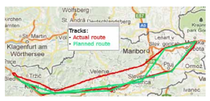
Fig. 7. Navigation Using the Mobile Device

The tests revealed a number of problems that need to be considered when implementing Android mobile navigation in practice. The biggest problem is downloading Google Maps within the cache memory, because there is need to connect to a wireless network. On the other hand, Google Maps are not real navigational charts, but general maps. This calls for a fixed loading of the correct navigational maps on Android, which are not free of charge. Another problem is the large power consumption of mobile devices. This problem was partially solved by turning off the mobile network after the map had already been stored on the mobile device. A complete solution to this problem would be to use airplane's electrical system as a power source, for which an appropriate adapter would be needed.