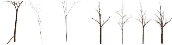
Figure 1. Rendered evolved parameterized procedural models at FEs = \{1, 8, 18, 1992, 2727, 3230\} ( NP = 100 , seed 1) and fifth, the reference image.

The recognition success is measured by similarity of the reference original images and the generated rendered images of evolved parameterized procedural models. To measure similarity of these images we chose to compare the images pixel-wise as follows. For each pixel rendered as non-background in the evolved image, we compute the Manhattan